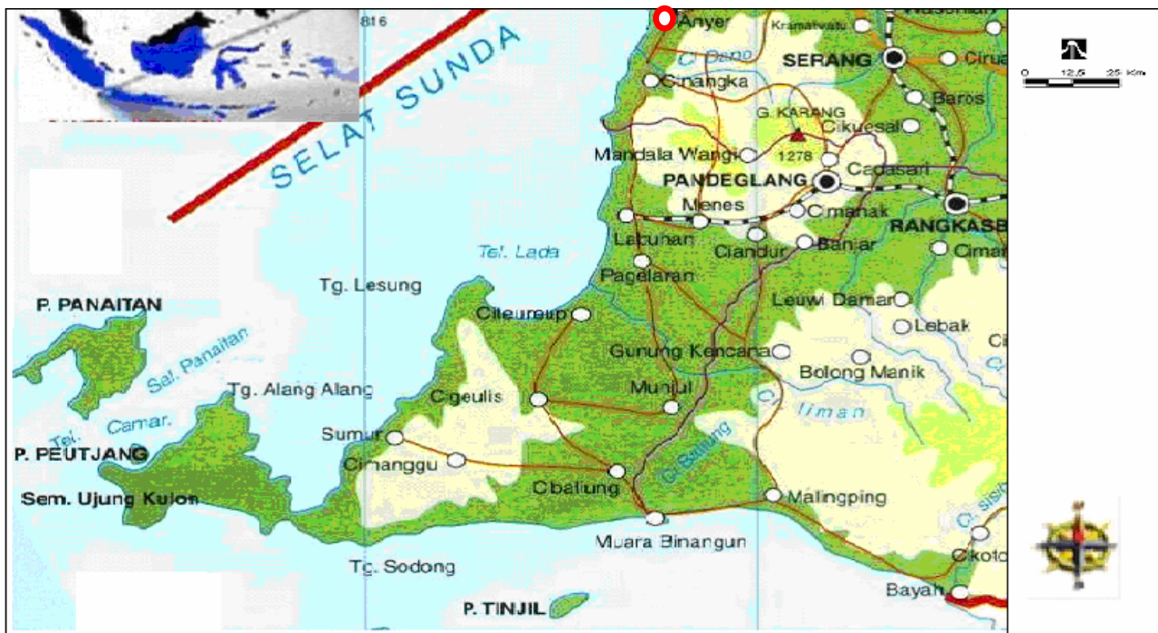
Figure 1 Anyer Coastal Tourism 2013

(Planned and created); (4) Utilization of natural coastal tourism; (5) Enjoy the beauty of the landscape, Fishing, and Eco lodge; and (6) Open source coastal tourism.