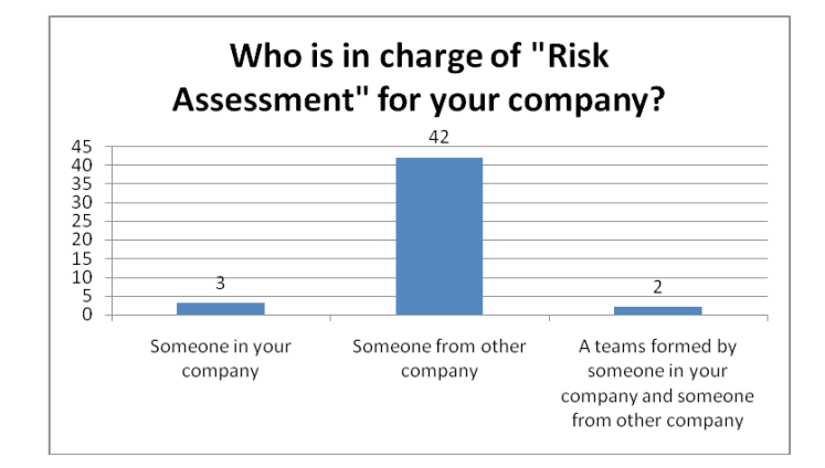
Figure 3: Survey Question 5 – Who is in charge of "Risk Assessment" for your company?

From the findings shown above we found that among the SMEs which done Risk Assessment is often lack of knowledge in the whole information security management life cycle (ISO, 2005). This may due to various reasons, includes some of common misunderstandings such as, Risk Assessment is a process which only need to be done once; Risk Assessment tools/software are extremely costly; Risk Assessment can be only taken by some security experts with ten and more years relevant experiences, and many more.