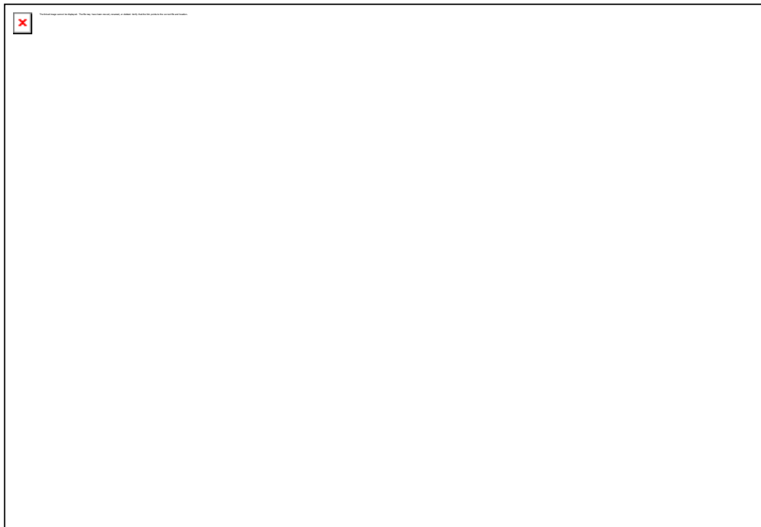
Figure 1: D 2 Pattern approach