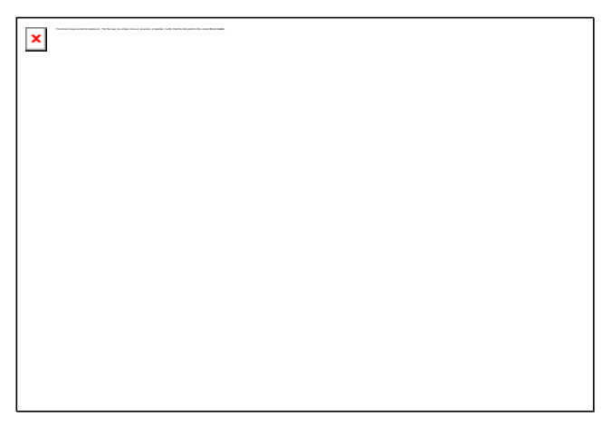
Figure 32: The Privacy level of users' information

Question 5 asks how often the users log in to their accounts. Most of the users (68%) log in daily, 22% log in several times per day, and 11% log in weekly or monthly. This shows that they are using the SNS to communicate at least once per day. This enables us to see how often users have the chance to be updated with new privacy setting of the SNS.