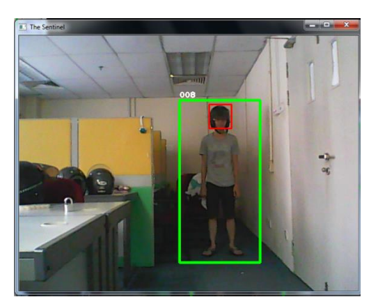
Figure 5. Detection of Concealment Headwear

For the second module, User Alert module will be responsible to alert the users once suspicious patterns are identified by the earlier module. User Alert Module consists of two submodules. The User Alert Core Service module is responsible to prepare a short report on the suspicious patterns and threats identified. On the other hand, Android Devices Connecting Interface module is used to connect to the users' Android devices and transmit the report as an early warning message to the user. Figure 6 shows the report consisting of a potential intruder bounder in a large box area where the threat probability score has exceeded the defined threshold (i.e. as part of the User Alert Core Service).