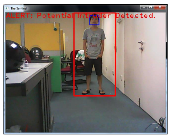
Figure 6. Detection of a Potential Intruder

For the second module, User Alert module will be responsible to alert the users once suspicious patterns are identified by the earlier module. User Alert Module consists of two submodules. The User Alert Core Service module is responsible to prepare a short report on the suspicious patterns and threats identified. On the other hand, Android Devices Connecting Interface module is used to connect to the users' Android devices and transmit the report as an early warning message to the user. Figure 6 shows the report consisting of a potential intruder bounder in a large box area where the threat probability score has exceeded the defined threshold (i.e. as part of the User Alert Core Service).