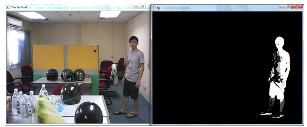
Figure 4. Background Subtraction