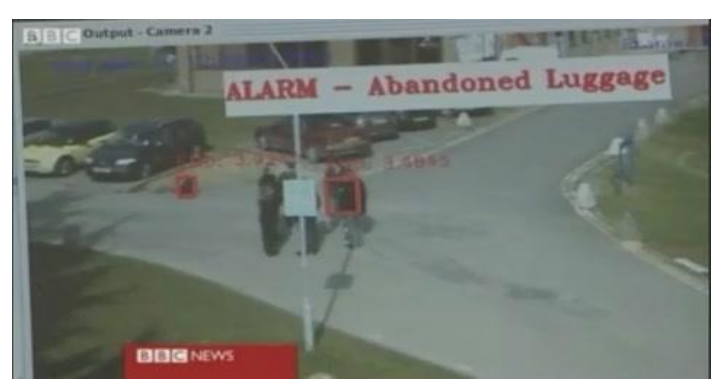
Figure 1: Experiment on "Intelligent CCTV"

Nevertheless, BBC had performed an experiment to test out the capabilities of the system. The experiment involves a volunteer abandoning a bag (which is a suspicious item according to the system) among a small crowd and then walking away to see if the system can identify this behavior. The system then compares the movement among the small crowd and an alarm was issued before the volunteer can leave the area with the bag and the "possible bomber" identified. The screenshot showing the system in action is shown in Figure 1. Interestingly, it may appear to be a false positive when someone did actually drop their bag, but still, it's better than a false negative where the system didn't pick up an actual suspicious activity. It is, indeed, better safe than sorry (Today Online 2013). Table 1 shows the features of the existing systems.