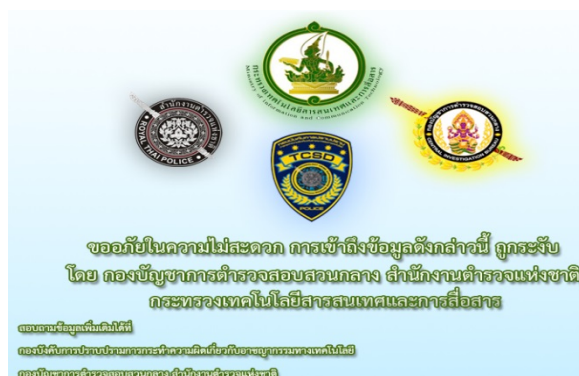
Picture 2: the screenshot informs that the website is blocked by the MICT, Royal Thai Police, Central Investigation Bureau and Technology Crime Suppression Division. This screenshot has been used since May 2014 (after the 2014 coup d'état ).