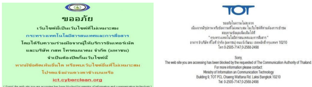
Picture 1: the screenshots inform that the website is blocked by the MICT (on the left) and by TOT ISP (on the right). These screenshots were used until the 2014 coup d'état .

The MICT will submit the block-list, together with a request for a judicial order (which is approved by the MICT Minister), to a competent court. When the court issues a judicial order permitting Internet censorship, the judicial order and the block-list will be passed on to all ISPs in Thailand by the MICT. Subsequently, the ISPs implement website-blocking by inputting the URLs on the block-list onto special software (server-based filtering). As a result, when users attempt to access a particular blocked website, they will be diverted to a screenshot stating that the website has been blocked by the MICT.