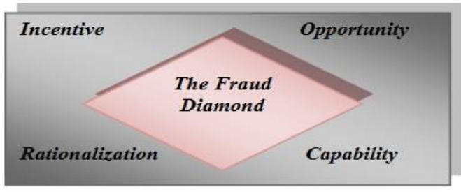
Figure 2.3 Fraud Diamond Model