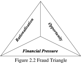
rigure 2.2 rraud Triangle

Fraud is an act and the action taken deliberately, consciously know and want to abuse everything that belongs together, for example: resource companies and countries for personal enjoyment and then presenting misinformation to cover up such abuse.