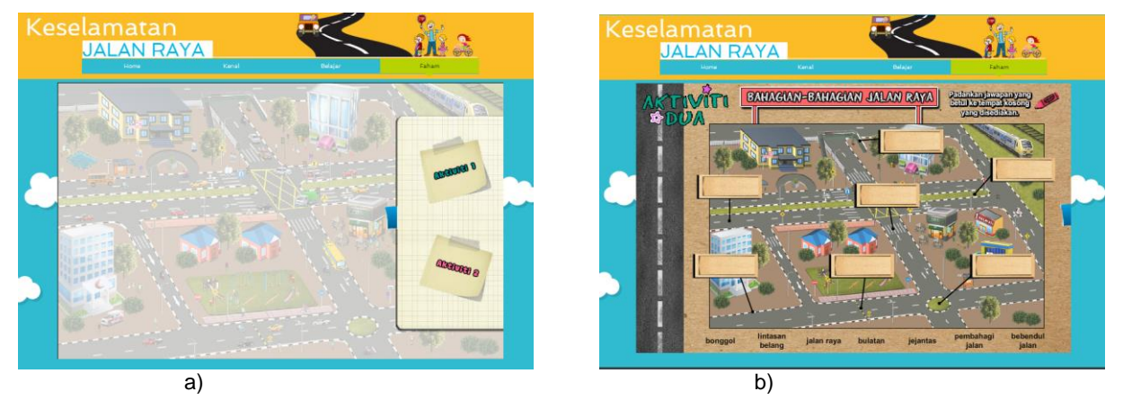
Figure 3 Screenshots of Faham Module

Upon clicking the Faham tab, users will be presented with two options of interactive activities Figure 3(a). Both are fill-in the blanks activities; user needs to drag and drop provided answers into correct boxes. Figure 3(b) illustrates activity 2 page.