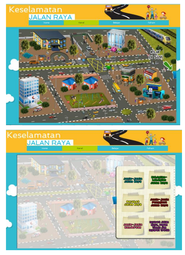
Figure 1 Screenshots of Kenal Module

With the intention of not to bore the children, the application provides multiple representation of the contents in the module such as combination of real images, text, sound, and rich virtual modeless feedback (RVMF) in which a pop-up window appears when a user points to any pointer (point of interaction). Figure 1 shows the screenshots of the Kenal module.