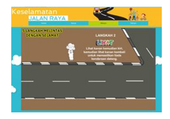
Figure 2 Screenshot of the Belajar Module

In the Belajar (learn) module as illustrated in Figure 2, the application focuses on the universal five steps to cross the road safely. The topics are represented in animation and text narration. The animation is done in a slow phase so that the children can easily follow the steps.