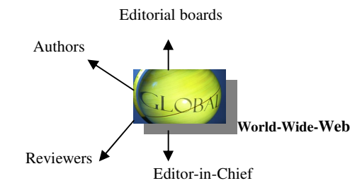
Fig. 1. Groups in peer-review process.

Even after all reviewers recommend publication and all reviewer criticisms/suggestions for changes have been met, papers may still be returned to the authors for updating.