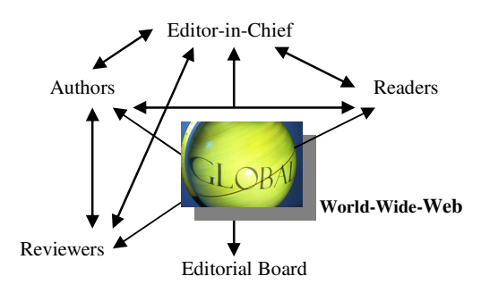
Fig. 3. Interactions among authors, readers, reviewers, and editors are intensified.