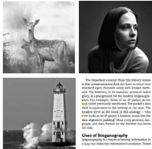
Figure 3. Secret images: greyscale image of 256 \times 256 pixels

In Figure 5 had shown the comparison the results of the stego-image. After hiding data with presented techniques and simple LSB substitution, the result had found that presented techniques will not show up any noticed trace