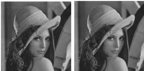
Figure 5. Stego-image from simple LSB substitution (Left) and presented techniques (Right) with secret image 'Zoocy'