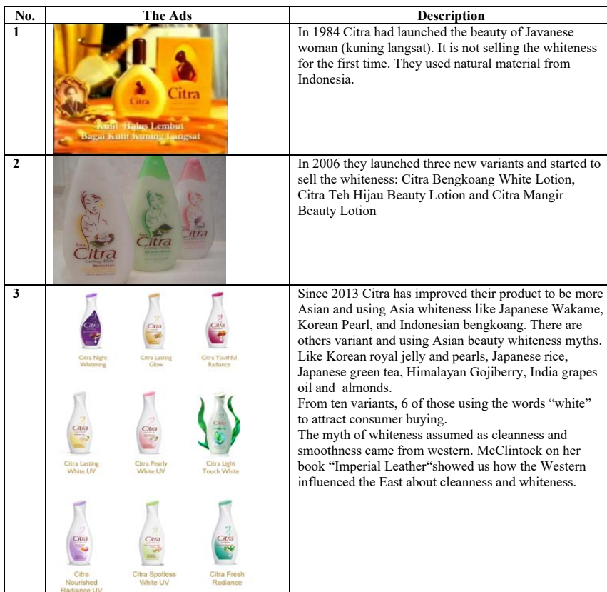
Table 1. Citra Body Lotion's Evolution [8].

As we seen from the table above, Citra used white representation to sell their products. From the ads we can see how whiteness becomes something good and idolized. White skin color is more than a fantasy; it is a concept to describe beauty to Indonesian women. The current reality is determined by the market. Formerly women flocked make ringlets