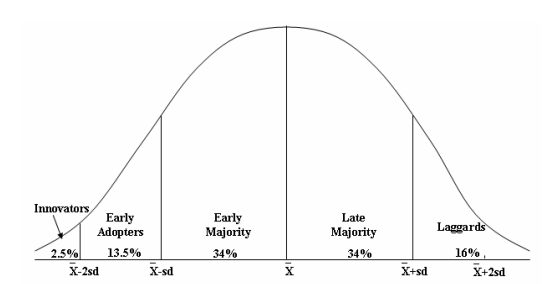
Figure 1 Level of technology adoption

Higher rates on Innovators and Early Adopter in adopter categorization of innovations could occur if the innovations was routinely utilized and colleagues take their roles in making the innovation useful [22].