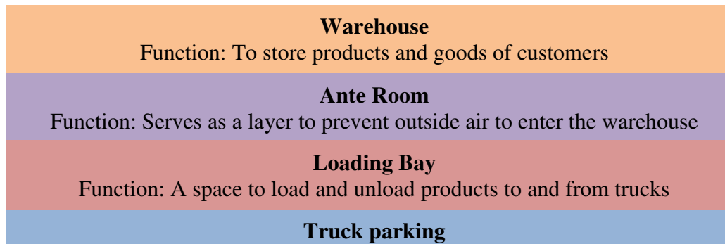
Diagram 1 Floor plan of ICCL's warehouse

ICCL also came out with other brilliant ways to reduce the outside air from entering the warehouse. For example, there are balloons seal around the truck during loading to prevent the air entering the warehouse from the gaps between the trucks and walls. They also try to request customers to provide products that are already frozen or chilled to reduce the usage of the temperature compressor. Extra charges will be charged on products that are not frozen or chilled when delivered to the warehouse and also to open-air trucks. ICCL uses four types of storage system, which are the steel racking, single deep racking, double deep racking and mobile racking. There are temperature sensors installed inside the warehouse to sense if there are any changes in the temperature of the warehouse. GPS that has temperature sensors were also installed in the company trucks to enable the company to track the location of the truck and read the air temperature inside the truck.