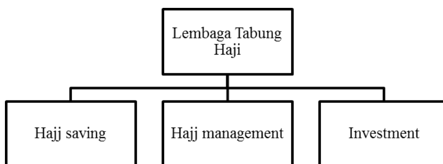
Chart One: The Operational Structures of Lembaga Tabung Haji